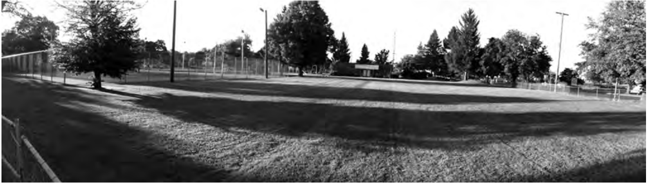
(Above) The view of the proposed space taken from Cypress St. (Below) A working concept of the area to be fenced off 2012 including future improvements like walkways, trees and benches.

Working with community partners, the P&R considers the lawn space at Cypress & Division Streets to be an opportune location for the City's first dog park. This space is ideal because it is currently under-utilized, yet maintained. It also has bathroom facilities, water access and parking are already in place. It is also a walkable destination for many residents. We have identified other options, but we consider this the first in what could be a series of additional dog parks, developed at a later date, if this proves popular and successful. It is understood that a name change is appropriate as requested by the Veterans Coalition.