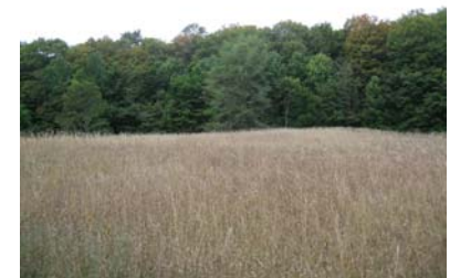
Natural Features - Tree-line and steep slopes of the Garfield Township Parkland

Groundwater on the easterly and westerly portions of the campus (on the hillside and near the wetlands) may restrict the practical depth of basements which may necessitate dewatering for utility construction. Perimeter drains for structures and basements are recommended as a rule for any new construction.