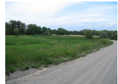
Wetlands - Wetland area near Silver Drive.

Up from the wetlands the land changes to either natural meadow or a developed, park-like landscape. The natural meadow extends from the wetlands to the base of the bluffs along the south side of the campus. It encompasses the Traverse Bay Area Intermediate School District property and the barns area and is the most dominant land type viewed from Silver Lake Road. The meadow contains pockets of cattail marsh indicating underground seeps. The natural meadow is as important as the wetlands as a natural setting and peripheral buffer for the site.